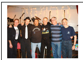
Four and a Bit

On Saturday 13 th November, Radcliffe on Trent Male Voice Choir will be giving a concert in St Michael's Church Centre to raise money for the Tower fund. Their programme is varied and exciting. Tickets will be on sale at a later date and we'll keep you informed.